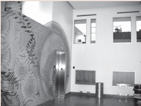
The Genetics Office overlooks the sweeping new entrance way that features a mosaic by artist The Sebastian.

The new addition to the Genetics Biotechnology Center was dedicated on April 14 with an Open House. The dedication marked the celebration of the first stage of BioStar - a public-private partnership between the State of Wisconsin and the University of Wisconsin to fund campus construction. Future construction includes a Microbial Sciences Building, an upgrade to the Biochemistry Building and the Wisconsin Institute for Discovery.